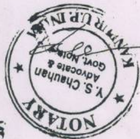
Photo Copy Attested