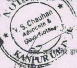
Photo Copy Attested

अतः ग्राम रमईपुर की खाता संख्या 660 में आराजी संख्या 1173/1.613हे0 भूमि को उ0प्र0जेड0ए0एल0आर0एक्ट की धारा- 143 के अंतर्गत अकृषिक/आवासीय भूमि घोषित किया जाता है। तहसीलदार की आख्या दिनांक 05-03-2011 आदेश का अभिन्न अंग होगी। तदनुसार परवाना अमलदशमद जारी होना आदेश की एक एक प्रमाणित प्रति तहसीलदार सदर एवं संबंधित उपनिबंधक को आवश्यक कार्रवाई भेजी जाय। पत्रावली वाद आवश्यक कार्यवाही दाखिल दफतर की जाए।